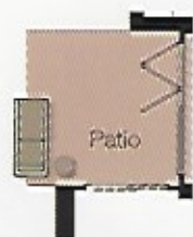
Optional Sliding Door at Great Room