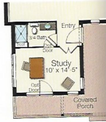
Optional 3/4 Bath (replaces Powder)