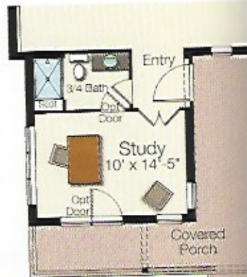
Optional 3/4 Bath (replaces Powder)