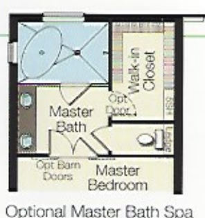
Optional Master Bath Spa