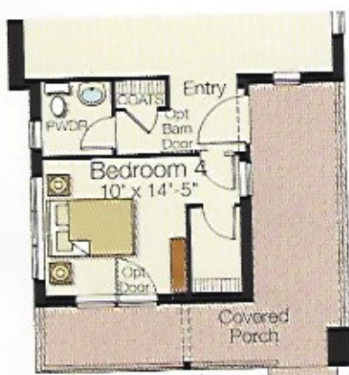
Optional Bedroom 4 (replaces Study)