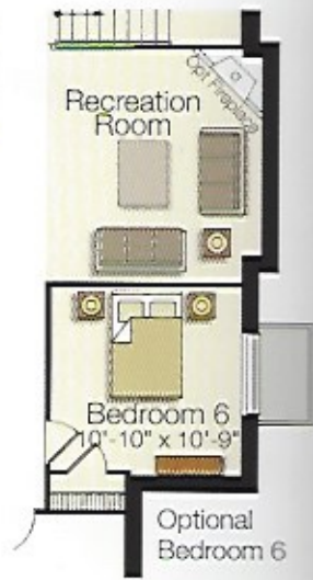
Optional Finished Basement Shown

Optional Finished Basement with Rec Room, Bedroom & Bath. 795 sq. ft. Elev. A. 733 sq. ft. Elev. B.