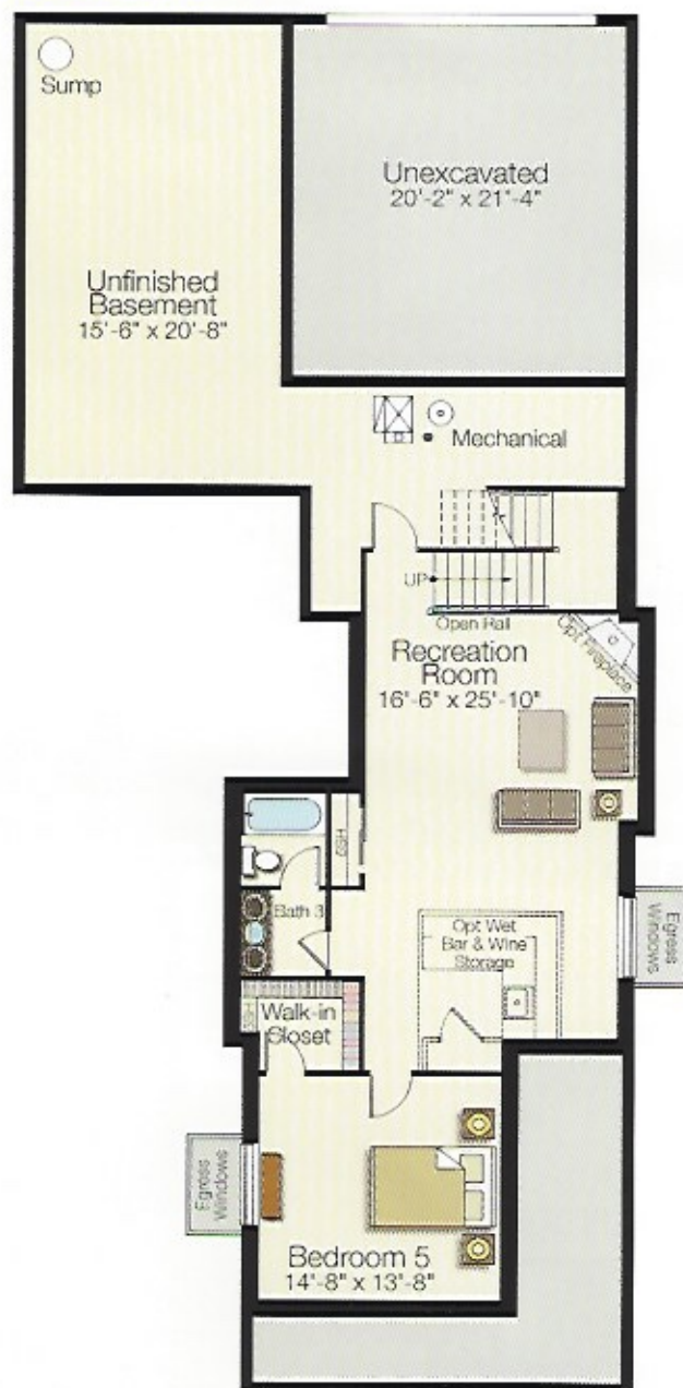
Optional Finished Basement Shown