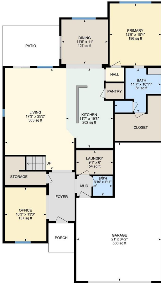
1st Floor Exterior Area 1672.55 sq ft