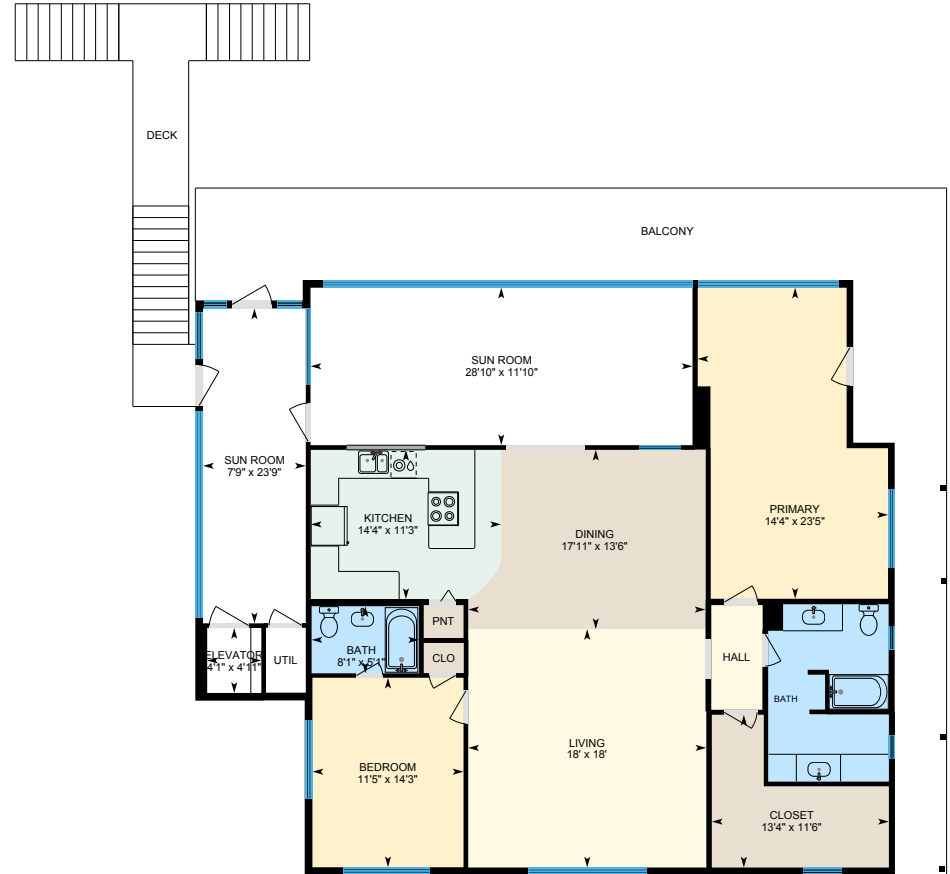
Main Floor Finished Area 1598.45 sq ft