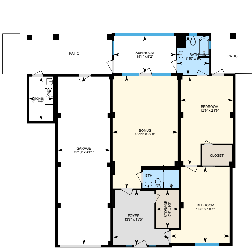
Ground Finished Area 1364.13 sq ft

Main Building: Above Grade Finished Area 2962.58 sq ft