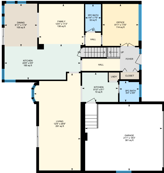
Main Floor Exterior Area 1283.09 sq ft

Main Building: Total Exterior Area Above Grade 2102.32 sq ft