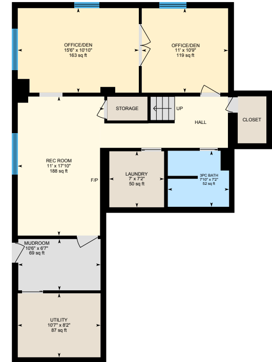
Basement (Below Grade) Exterior Area 1034.52 sq ft