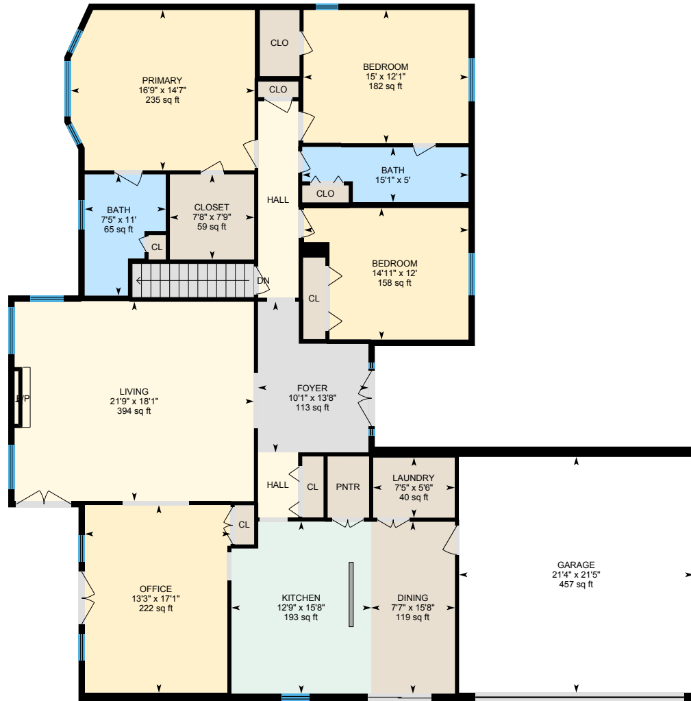
Main Floor Finished Area 2296.49 sq ft

Main Building: Above Grade Finished Area 2296.49 sq ft