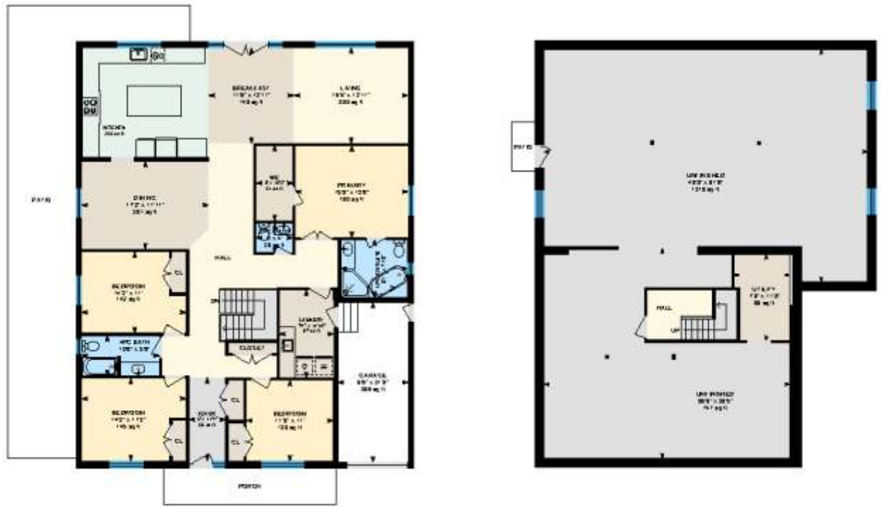
Main Floor Exterior Area 2391.95 sq ft

Main Building: Total Exterior Area Above Grade 2391.95 sq ft