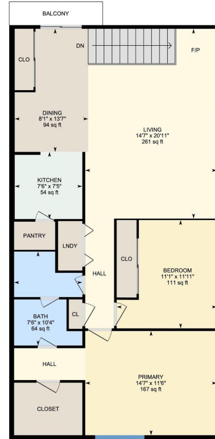
2nd Floor Exterior Area 1076.82 sq ft