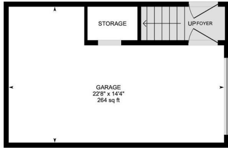
1st Floor Exterior Area 52.93 sq ft