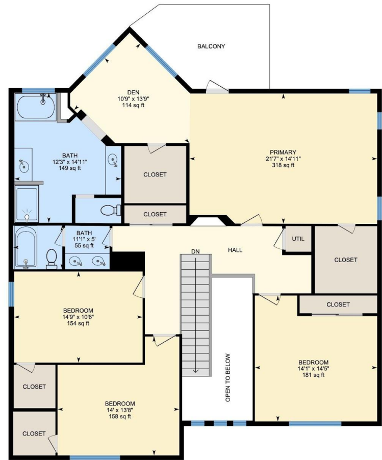
2nd Floor Exterior Area 1688.11 sq ft