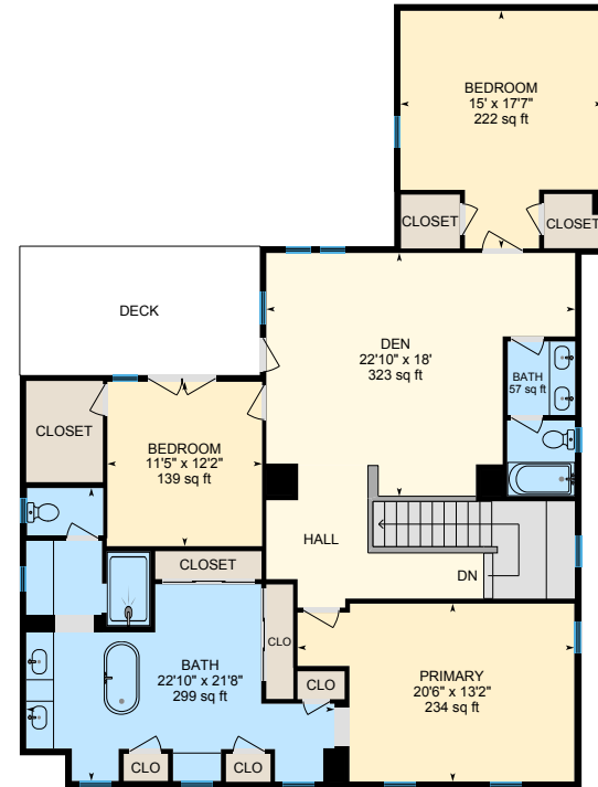
2nd Floor Finished Area 1774.74 sq ft