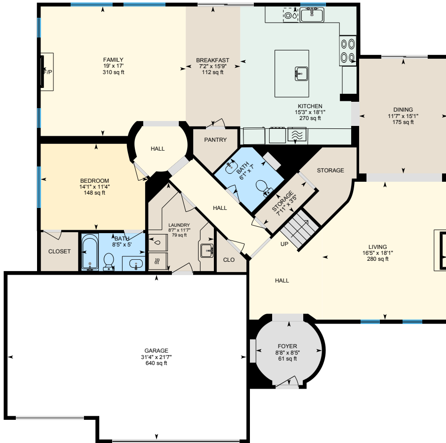
1st Floor Finished Area 2114.75 sq ft

Main Building: Above Grade Finished Area 4117.74 sq ft