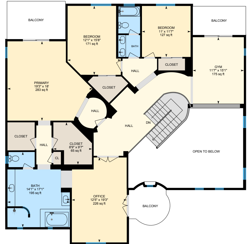
2nd Floor Finished Area 2002.99 sq ft