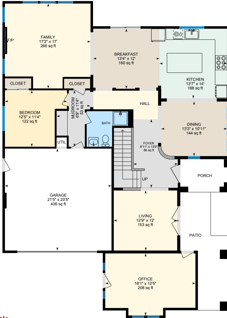
1st Floor Finished Area 1746.99 sq ft

Main Building: Above Grade Finished Area 3547.39 sq ft