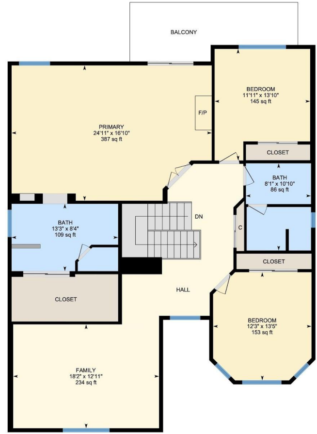
2nd Floor Exterior Area 1619.93 sq ft