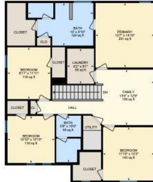
2nd Floor Exterior Area 1405.84 sq ft