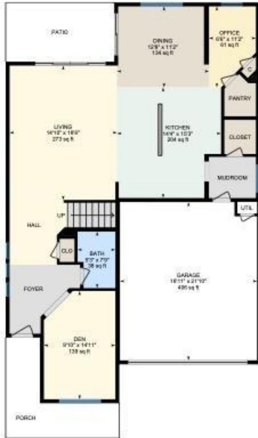
1st Floor Exterior Area 1235.58 sq ft