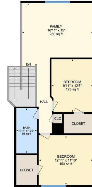
2nd Floor Exterior Area 849.88 sq ft