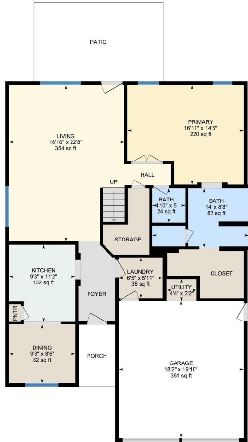
1st Floor Exterior Area 1288.75 sq ft