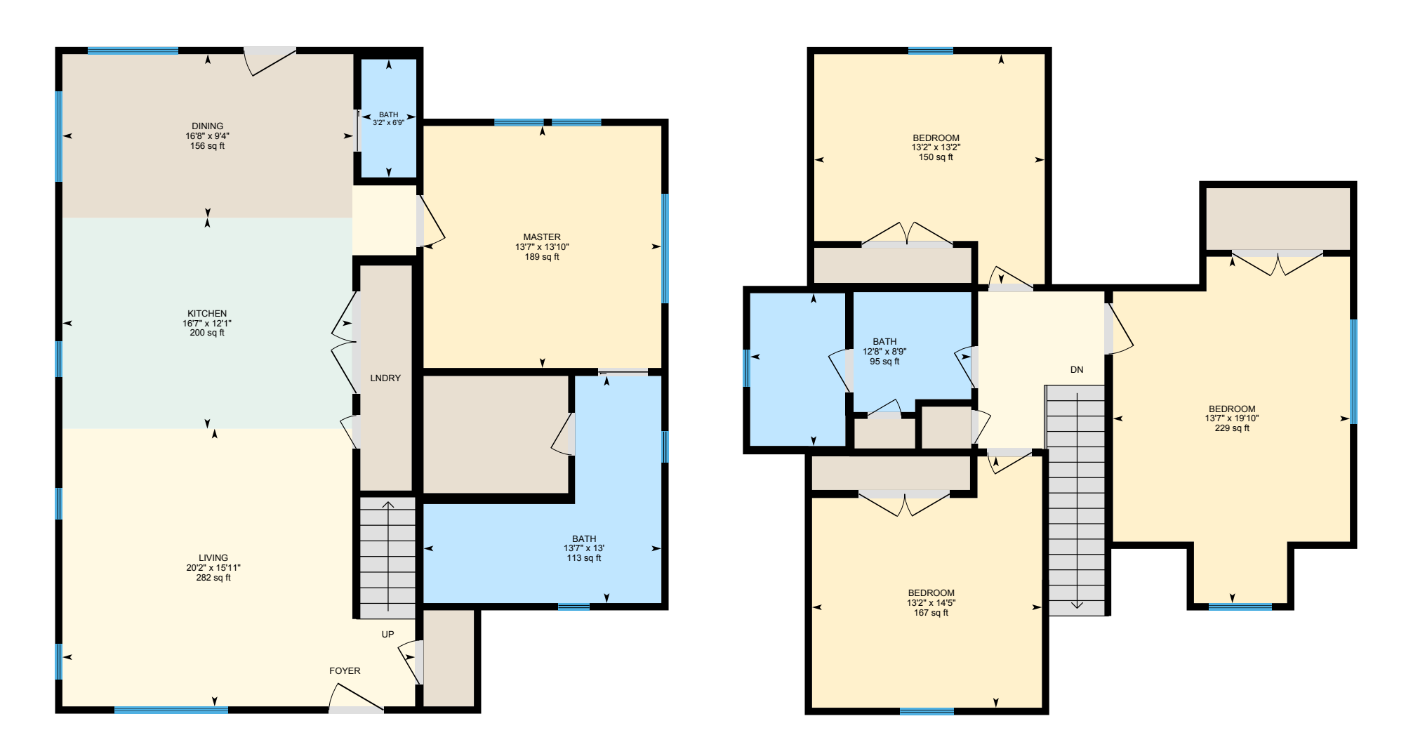
1st Floor Exterior Area 1219 sq ft

Main Building: Total Exterior Area Above Grade 2146 sq ft