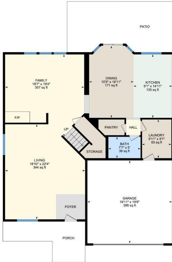
1st Floor Exterior Area 1329.11 sq ft

Main Building: Total Exterior Area Above Grade 2928.76 sq ft