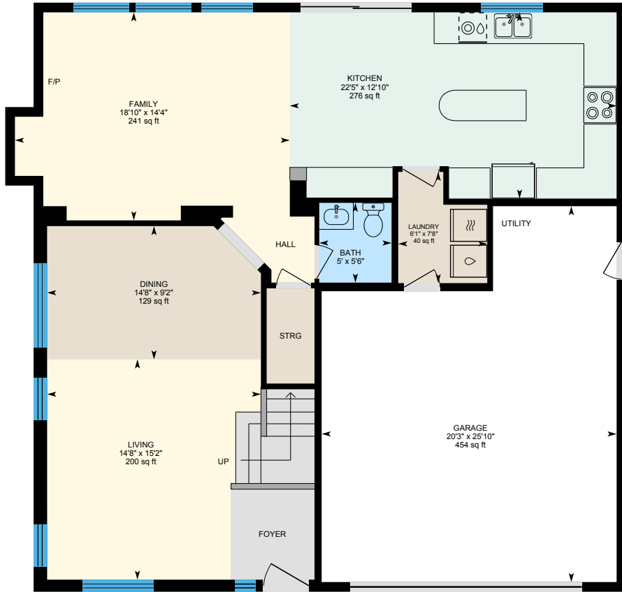
1st Floor Finished Area 1162.73 sq ft

Main Building: Above Grade Finished Area 2231.60 sq ft