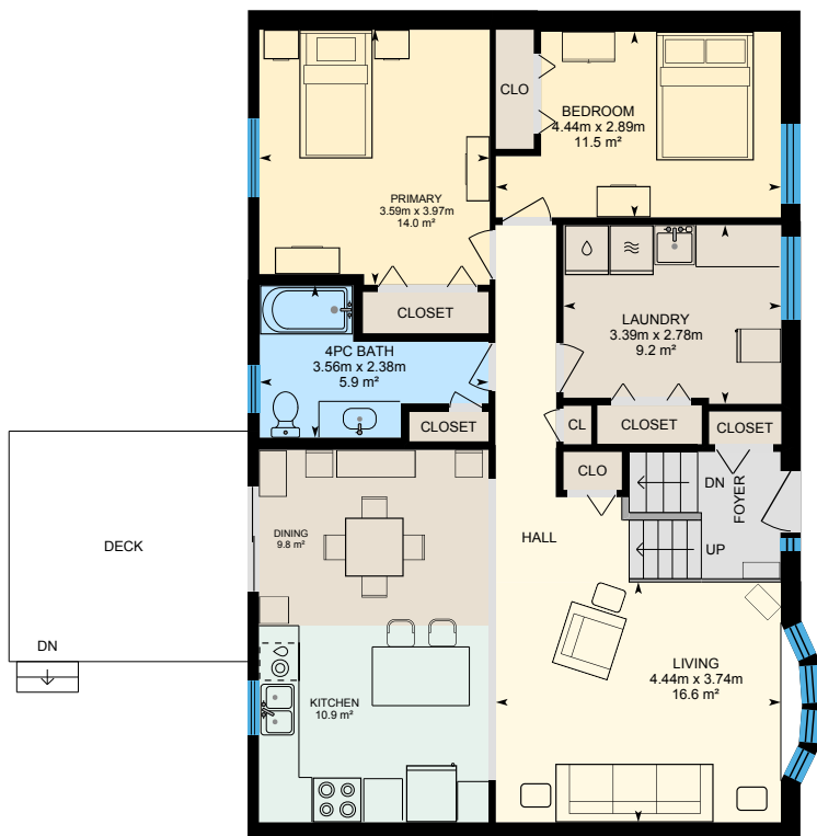
Main Floor Exterior Area 112.90 m 2

Main Building: Total Exterior Area 221.81 m 2