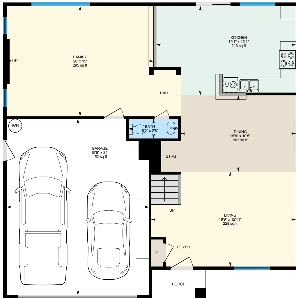
1st Floor Finished Area 1074.73 sq ft

Main Building: Above Grade Finished Area 1893.56 sq ft