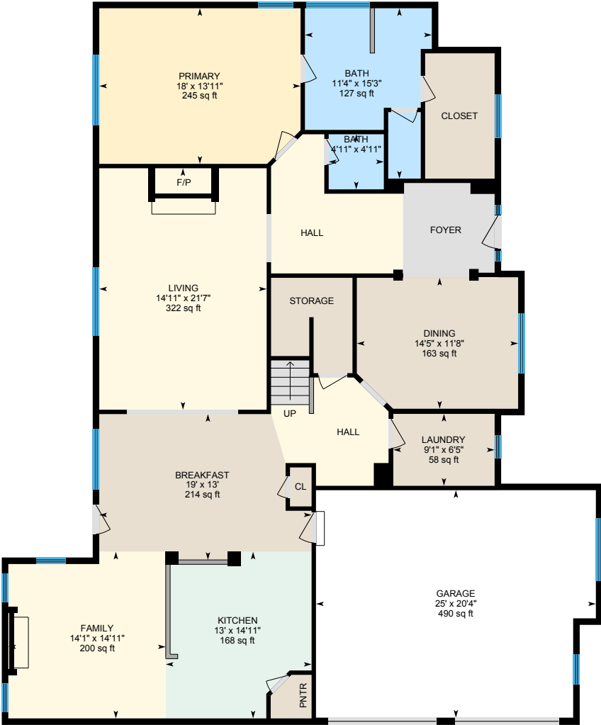
Main Floor Finished Area 2135.07 sq ft

Main Building: Above Grade Finished Area 3116.05 sq ft