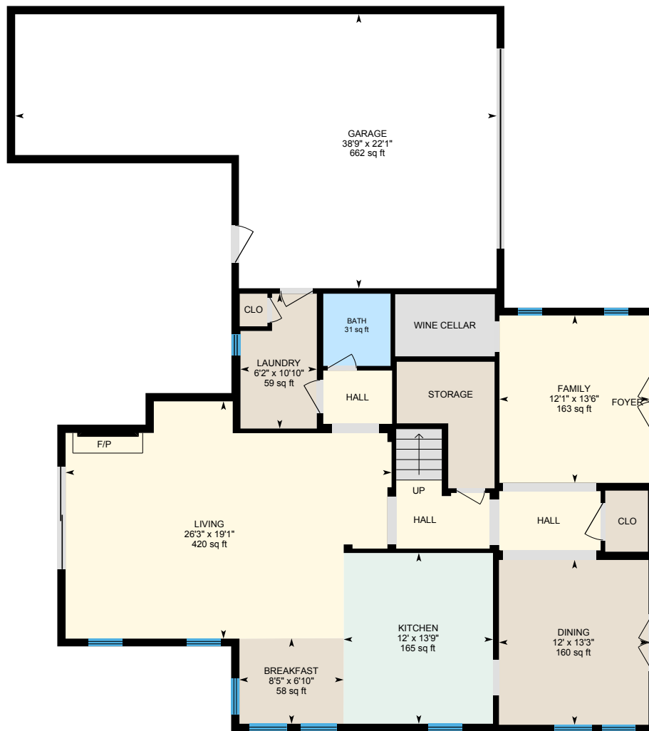
1st Floor Finished Area 1475.15 sq ft

Main Building: Above Grade Finished Area 2654.49 sq ft