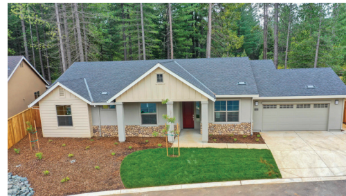
MARSHALL 3 BEDROOM A