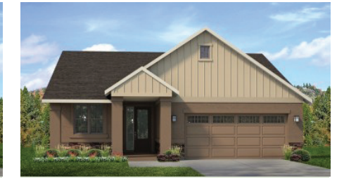
Sutter 3 Bedroom A 2224 Sqft | 3 Beds | 2.5 Baths