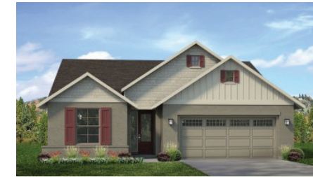
Whittmer 4 Bedroom B 1804 Sqft | 4 Beds | 2 Baths