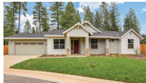
MARSHALL 3 BEDROOM B