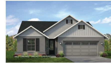
Whittmer 3 Bedroom A 1804 Sqft | 3 Beds | 2 Baths