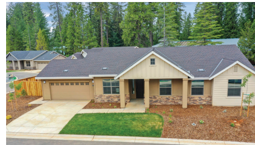
MARSHALL 4 BEDROOM A