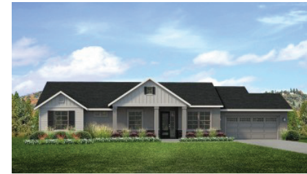
Marshall 4 Bedroom B 2080 Sqft | 4 Beds | 2 Baths