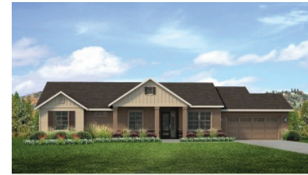
Marshall 3 Bedroom A 2080 Sqft | 3 Beds | 2 Baths