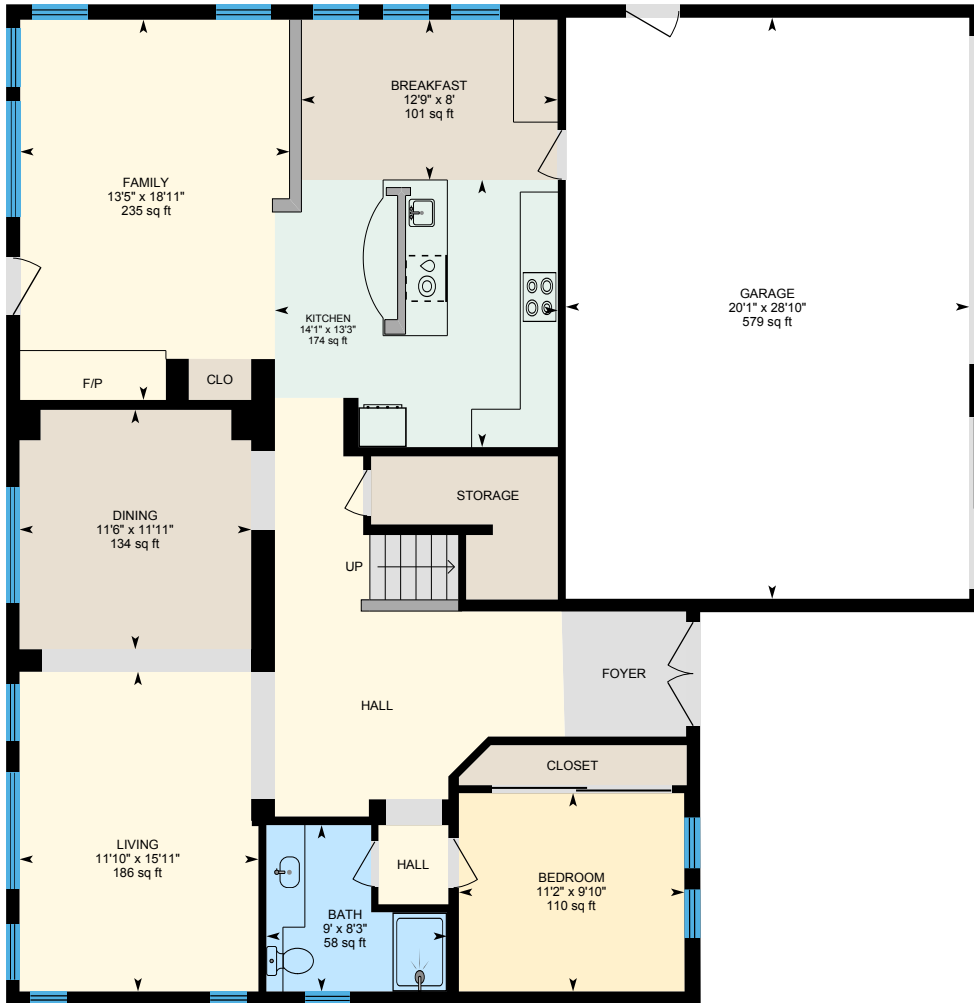
1st Floor Finished Area 1512.88 sq ft

Main Building: Above Grade Finished Area 2737.20 sq ft