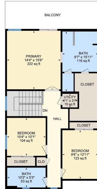
2nd Floor Finished Area 1051.05 sq ft