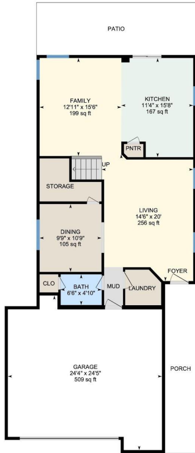
1st Floor Finished Area 987.76 sq ft