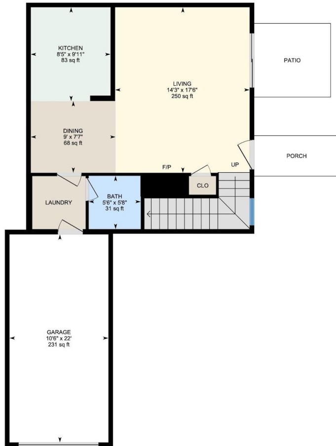
1st Floor Exterior Area 591.86 sq ft

Main Building: Total Exterior Area Above Grade 1328.07 sq ft