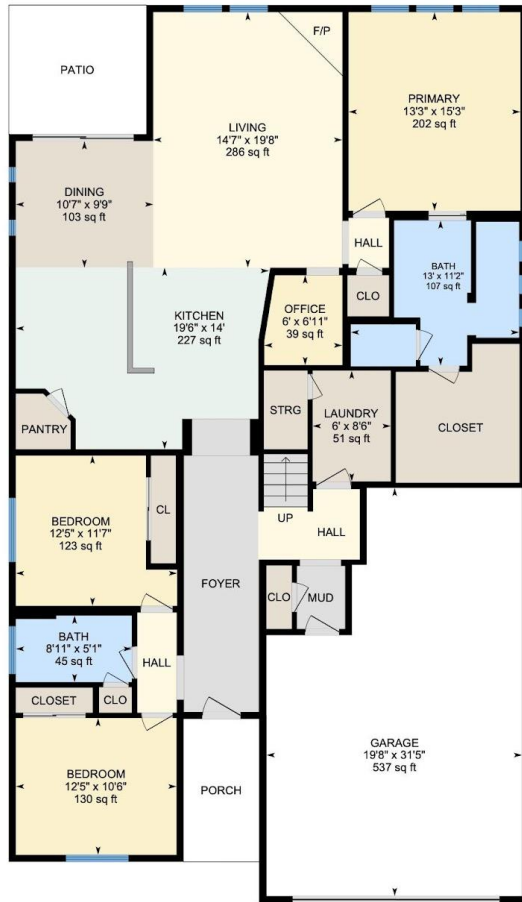
1st Floor Exterior Area 1961.76 sq ft

Main Building: Total Exterior Area Above Grade 3203.66 sq ft