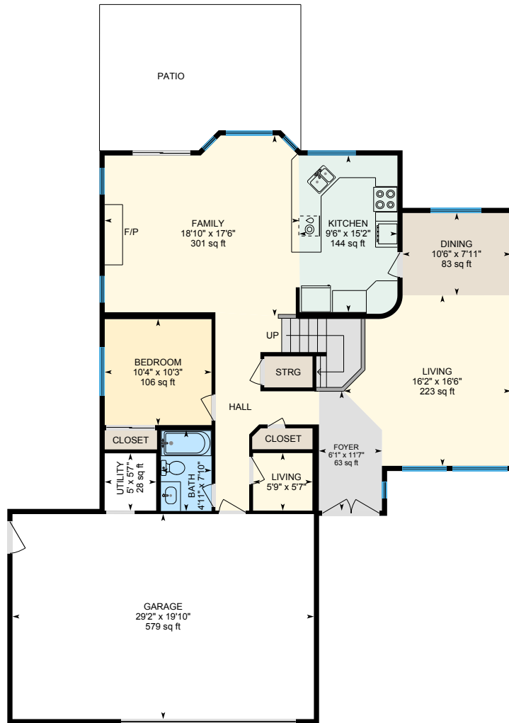
1st Floor Finished Area 1289.27 sq ft

Main Building: Above Grade Finished Area 2418.33 sq ft