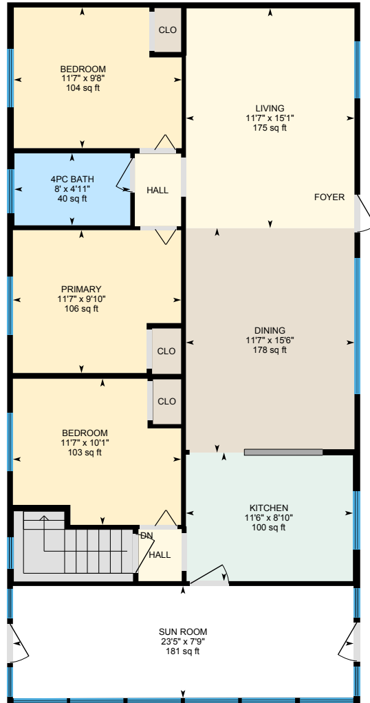
Main Floor Exterior Area 976.98 sq ft

Main Building: Total Exterior Area Above Grade 976.98 sq ft