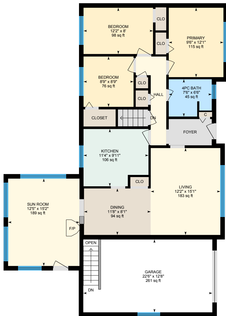
Main Floor Exterior Area 1263.11 sq ft

Main Building: Total Exterior Area Above Grade 1263.11 sq ft