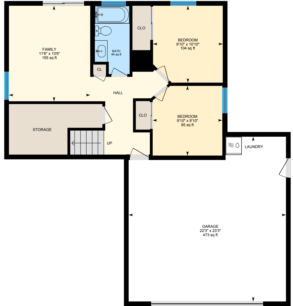
Lower Level Finished Area 706.30 sq ft