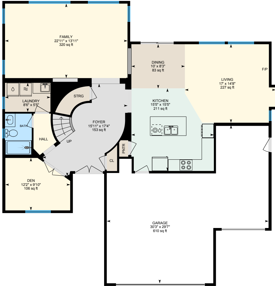
1st Floor Finished Area 1429.82 sq ft

Main Building: Above Grade Finished Area 2846.83 sq ft