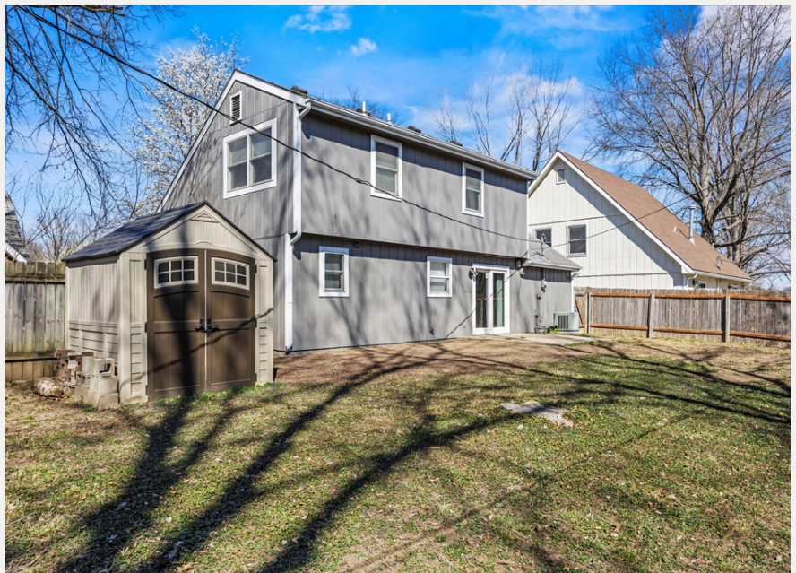
Some of the images have been virtually staged