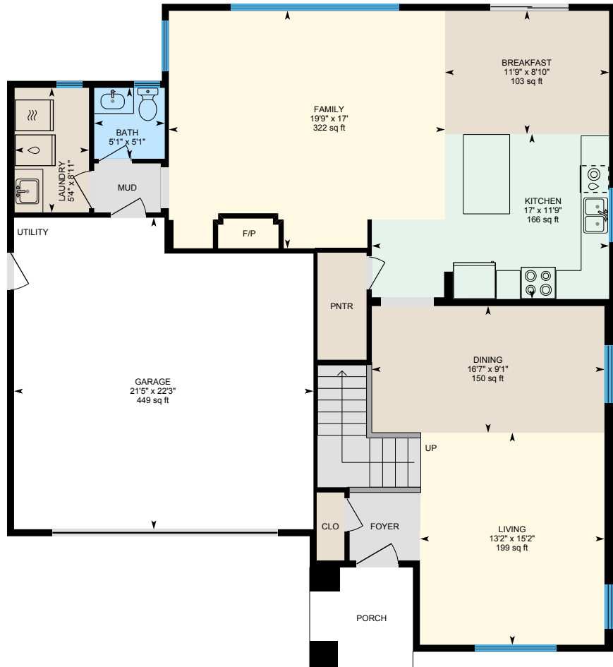
1st Floor Finished Area 1250.46 sq ft

Main Building: Above Grade Finished Area 2526.13 sq ft