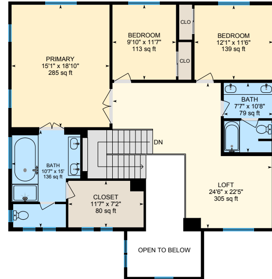
2nd Floor Finished Area 1386.24 sq ft