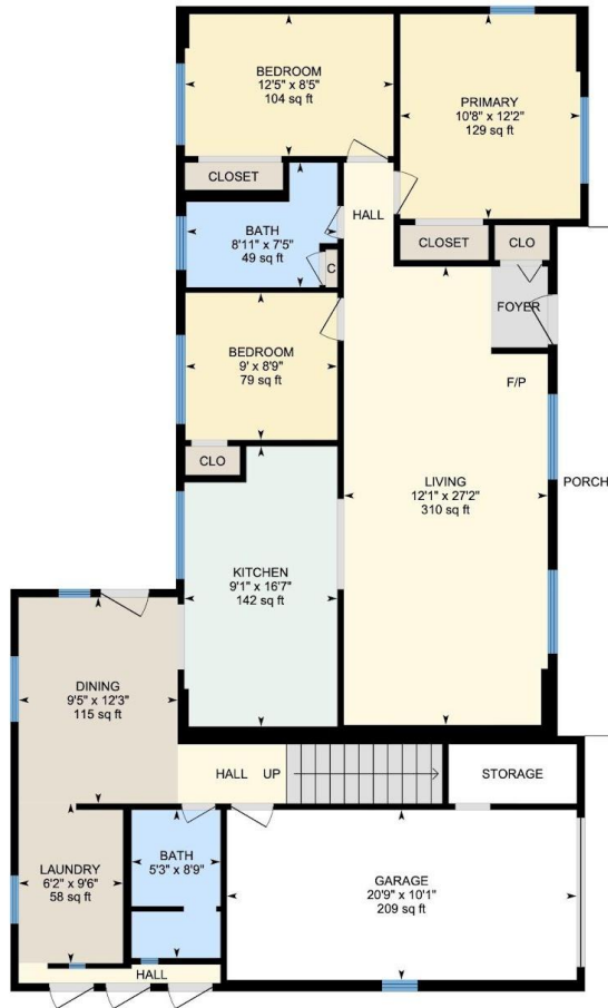
1st Floor Exterior Area 1350.27 sq ft