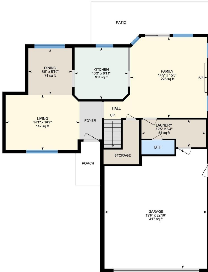
1st Floor Exterior Area 833.12 sq ft

Main Building: Total Exterior Area Above Grade 1712.06 sq ft