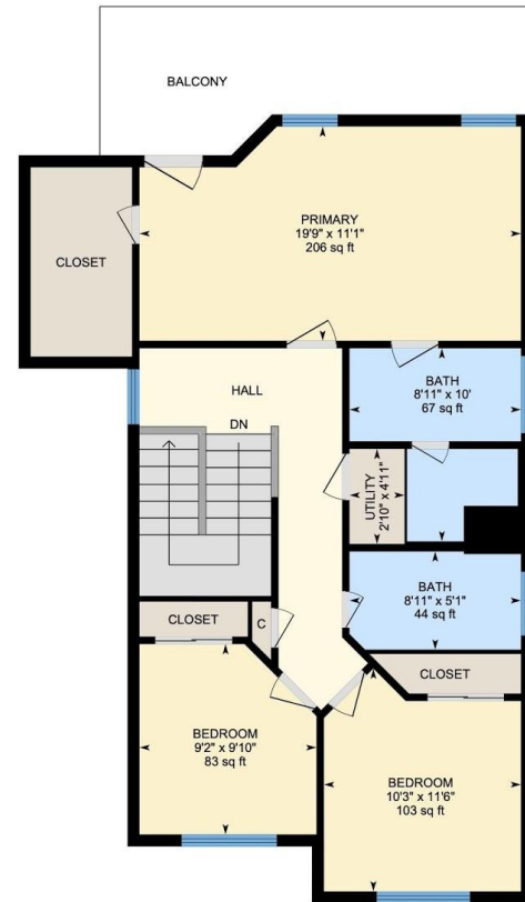
2nd Floor Exterior Area 878.94 sq ft