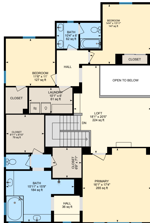
2nd Floor Finished Area 1582.86 sq ft