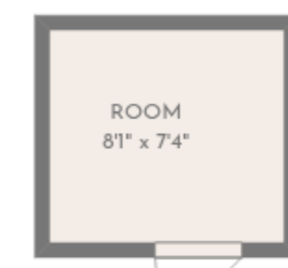
BACKYARD SEPARATE STRUCTURE