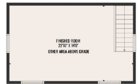
FLOOR 4 (OTHER AREA ABOVE GRADE)