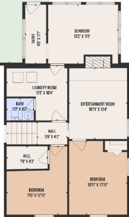
FLOOR 1 (BELOW GRADE)