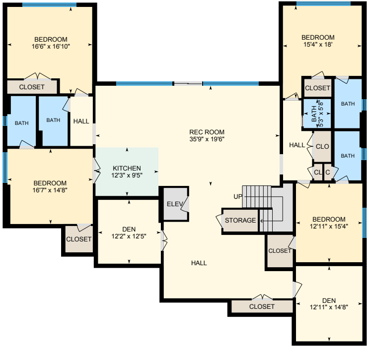
Lower Floor (Below Grade) Exterior Area 3419.88 sq ft