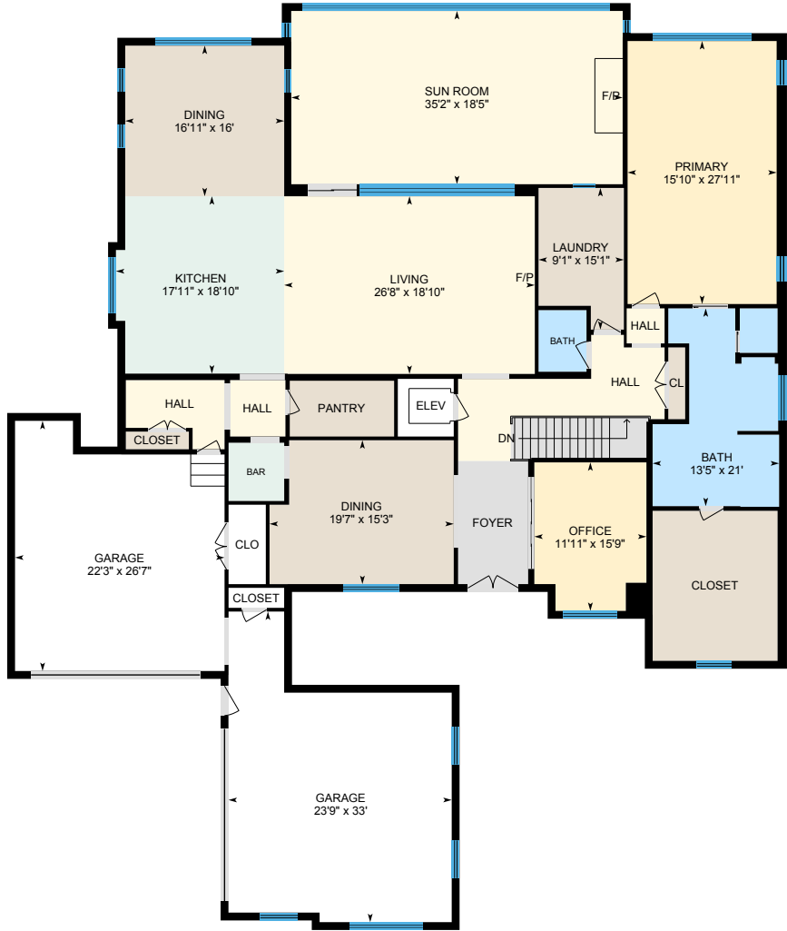
Main Floor Exterior Area 4251.86 sq ft

Main Building: Total Exterior Area 7671.74 sq ft