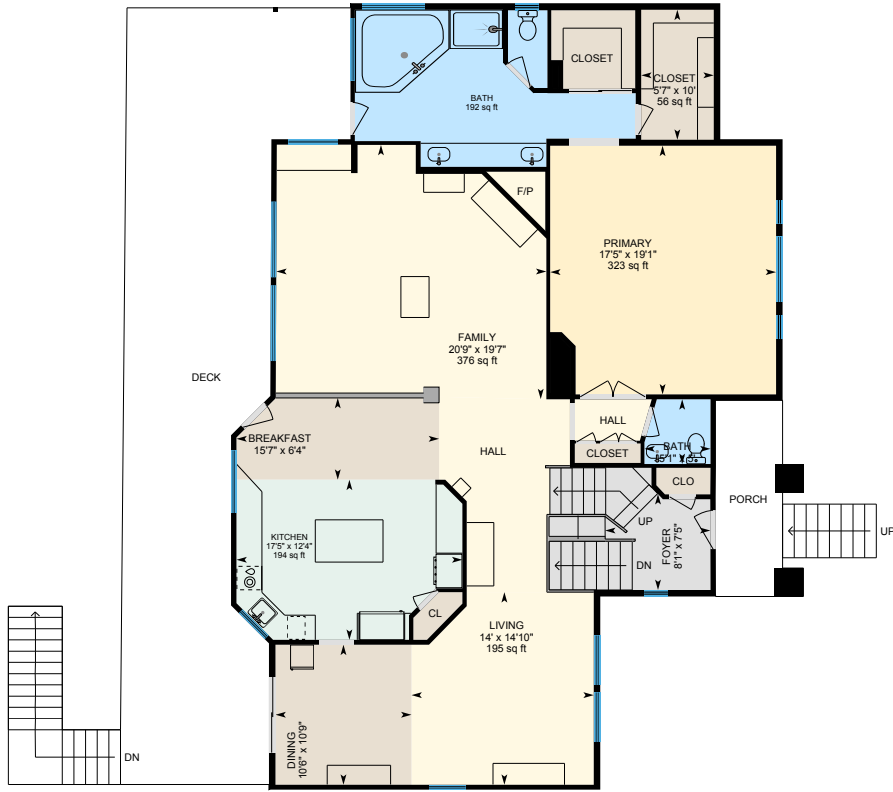
Upper Level Finished Area 2041.03 sq ft

Main Building: Above Grade Finished Area 3393.29 sq ft