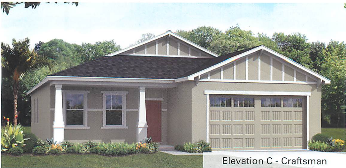
Elevation C - Craftsman