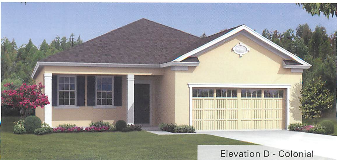
Elevation D - Colonial