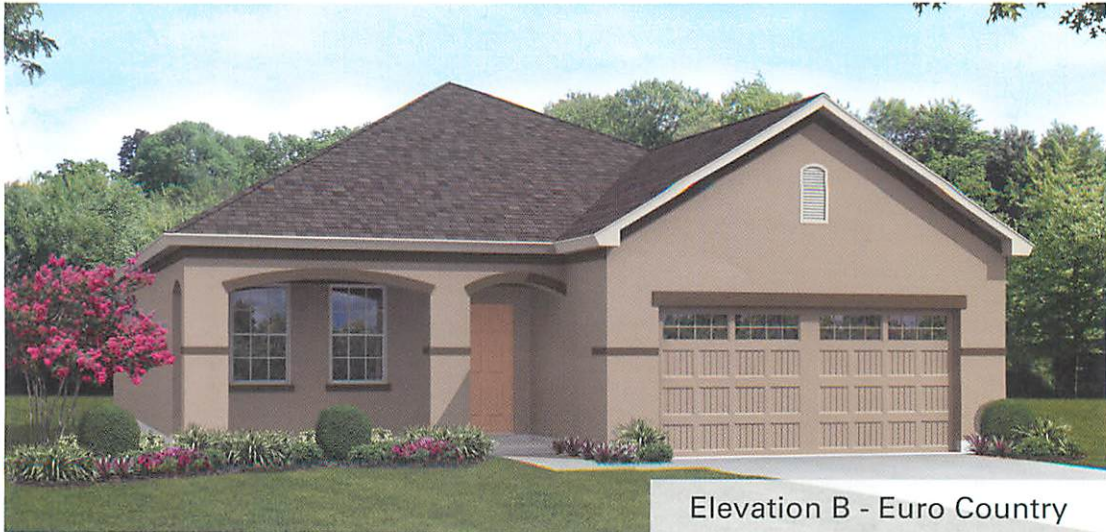
Elevation B - Euro Country