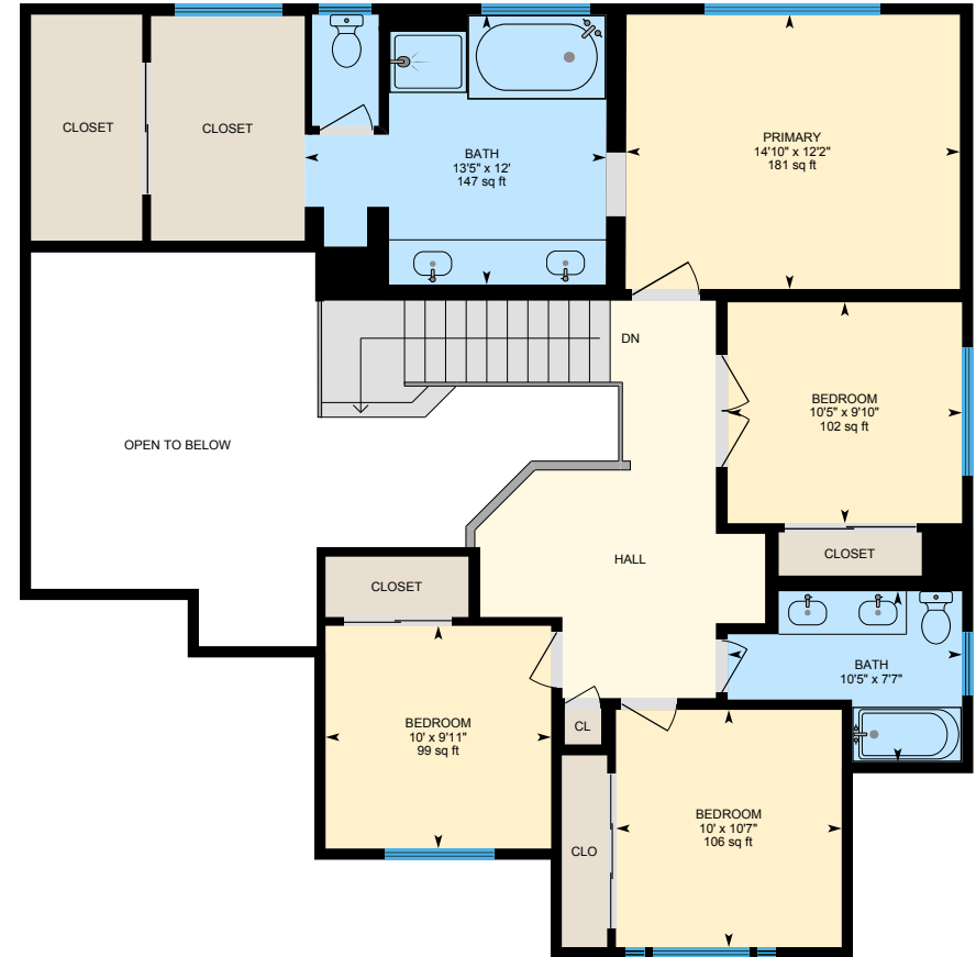
2nd Floor Finished Area 1226.86 sq ft