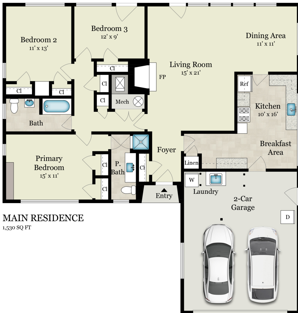
MAIN RESIDENCE 1,530 SQ FT