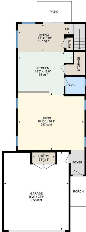
1st Floor Exterior Area 785.12 sq ft

Main Building: Total Exterior Area Above Grade 1800.16 sq ft