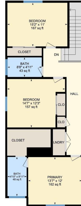
2nd Floor Exterior Area 1015.05 sq ft