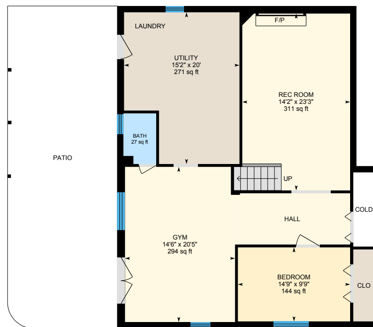
Basement (Below Grade) Finished Area 1358.69 sq ft