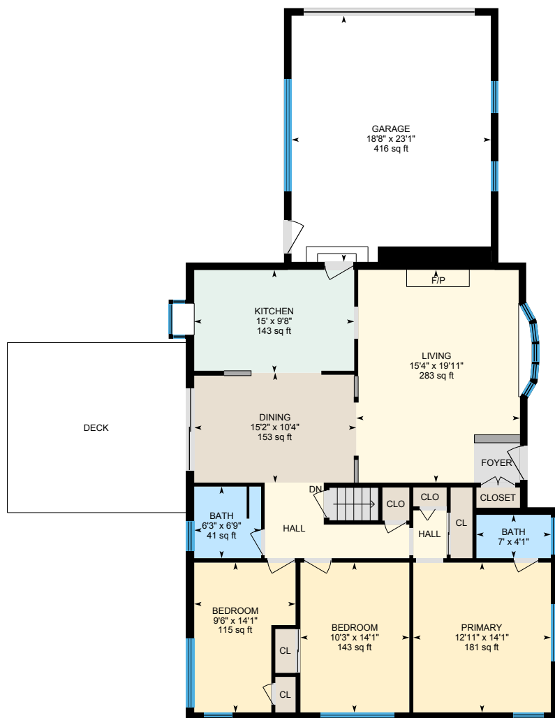
Main Floor Finished Area 1428.51 sq ft

Main Building: Above Grade Finished Area 1428.51 sq ft