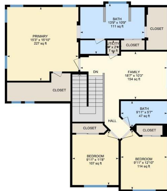
2nd Floor Exterior Area 1145.49 sq ft