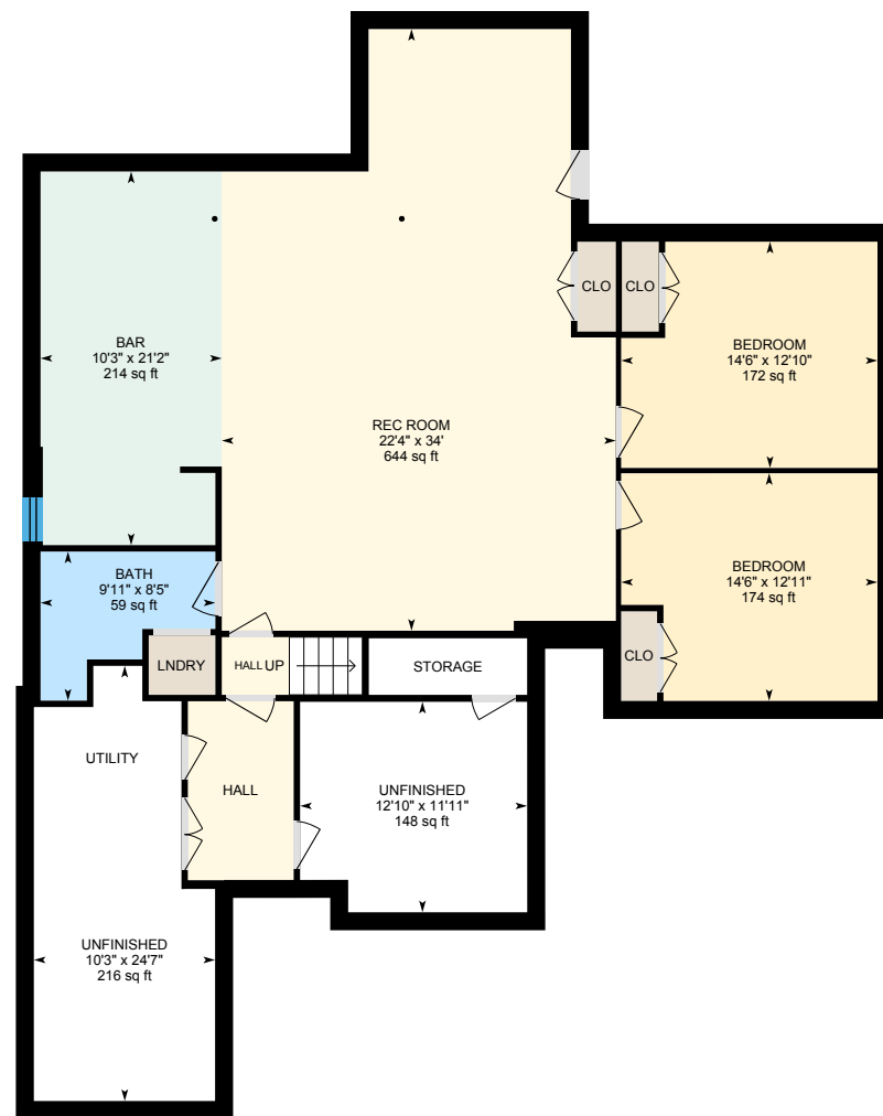
Basement (Below Grade) Finished Area 1587.58 sq ft