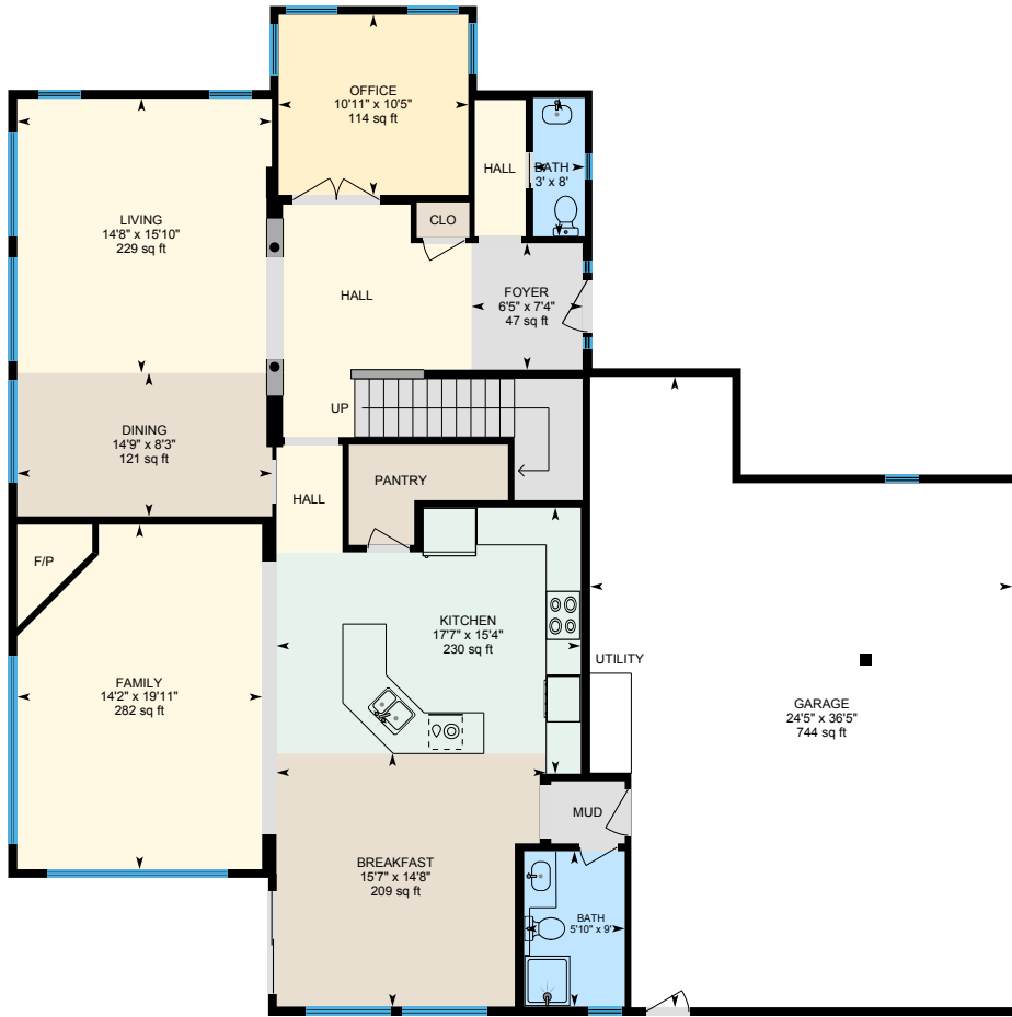
1st Floor Finished Area 1771.33 sq ft

Main Building: Above Grade Finished Area 3933.85 sq ft