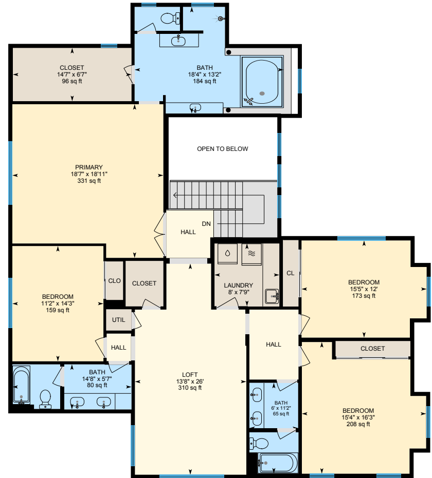
2nd Floor Finished Area 2162.52 sq ft