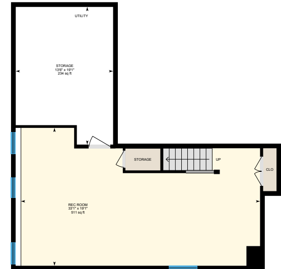
Lower Level (Below Grade) Finished Area 643.01 sq ft