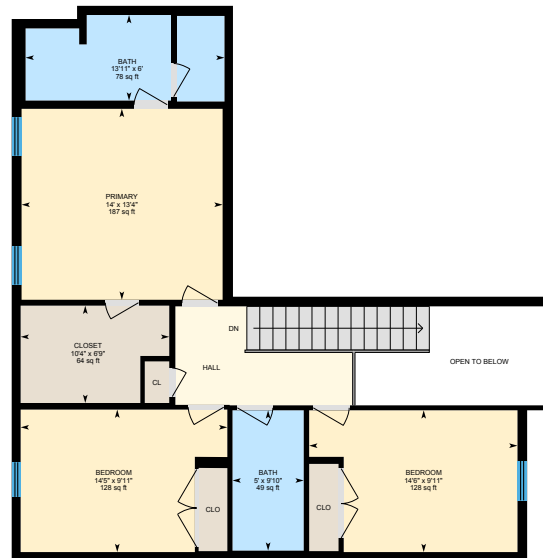
2nd Floor Finished Area 900.42 sq ft