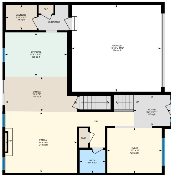
1st Floor Finished Area 1002.67 sq ft

Main Building: Above Grade Finished Area 1903.09 sq ft